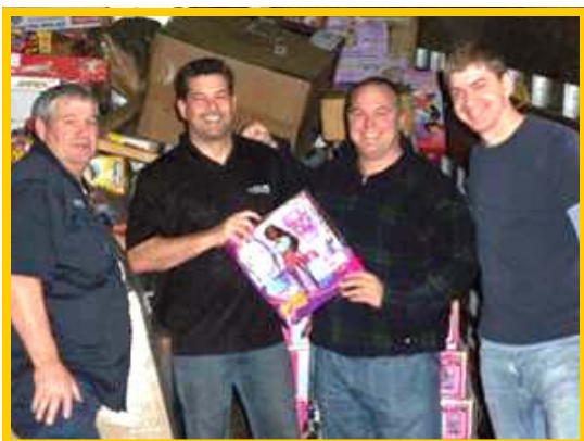
Woodall Foundation & Dallas Margarita Society volunteers loading the toys onto the truck.